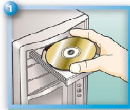
1 Load Avery® DesignPro® Sign Edition Software CD.