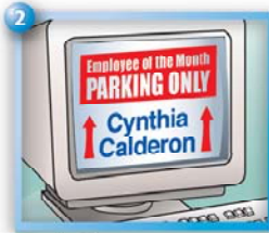
2 Design Sign.