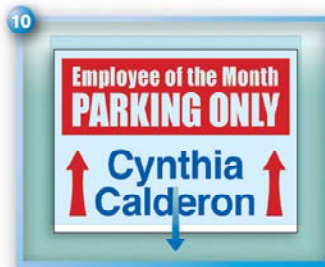
10 For all outdoor signs, slide sign into weather resistant sleeve for protection against sun, wind and rain.