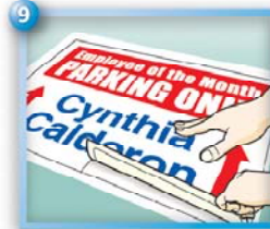
9 Repeat process with rest of sheets until sign is done.