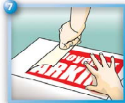
7 Smooth out any wrinkles. Sheets are repositionable so you can realign as necessary.