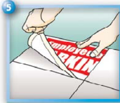
5 Position first sheet on center guide, applying pressure along one edge.