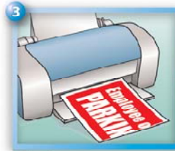
3 Print Sign.