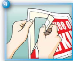
4 With the printed side facing up, peel off sheet. Leave center backing attached to sheet for now.