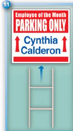
11 For the ground stake, insert metal stake into bottom of sign, and insert other end into ground.