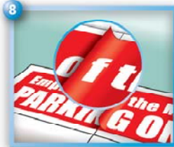
8 With next sheet, repeat steps 4-7. Match graphics up. Sheet edges overlap for a virtually seamless look.